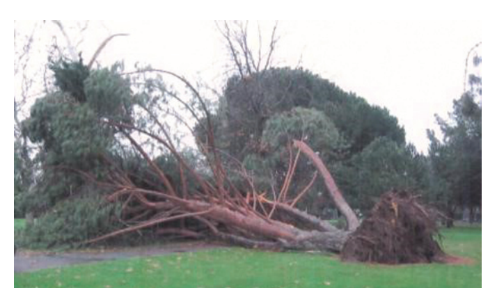
Figure 5. (Above) The most common type of failure in Italian stone pine is uprooting. Although dense crown is frequently associated with root failures, decay is not.

Figure 6. (Below) Girdling roots are reported to contribute to a number of failures in Italian stone pine. Here, a girdling root occurring at ground line was linked to the failure of this Italian stone pine.