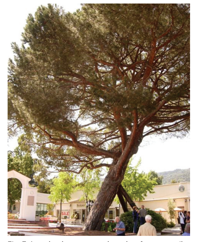
Fig. 7. Lean has been reported as a key factor contributing to root failure of Italian stone pine. Here, large props have been installed to reduce the failure potential of this leaning specimen.