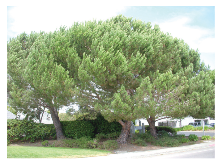
Figure 1. Italian stone pine is a relatively common landscape tree in California. Typically, it has a rounded crown and multi-stem structure.

By collecting detailed information following the failure of a tree, data can be compiled and then used to develop structural failure profiles for species. Such a profile has