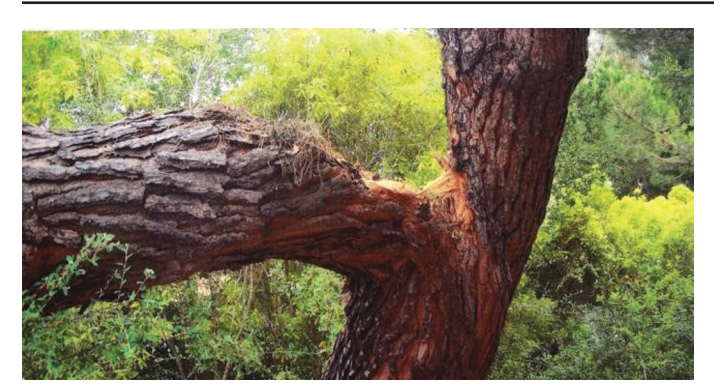
Figure 2. Many Italian stone pine branch failures occur at the attachment, rather than along the branch. Heavy lateral limbs (end weights), dense crown, and multi-stem structure were reported to be associated with branch failures.

Most failed trees were found in a group (57%), in high use areas (59%), and in residential areas (36%). The most common defect for all failures was dense crown, observed in 21% of reports, followed by multiple/codominant trunks (20%) and leaning trunks (15%).