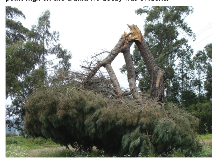
Figure 4. (Below) Decay was not present in 78% of trunk failures, but dense crown was reported to be a key factor. Here, an Italian stone pine with a dense crown failed at a point high on the trunk. No decay was evident.