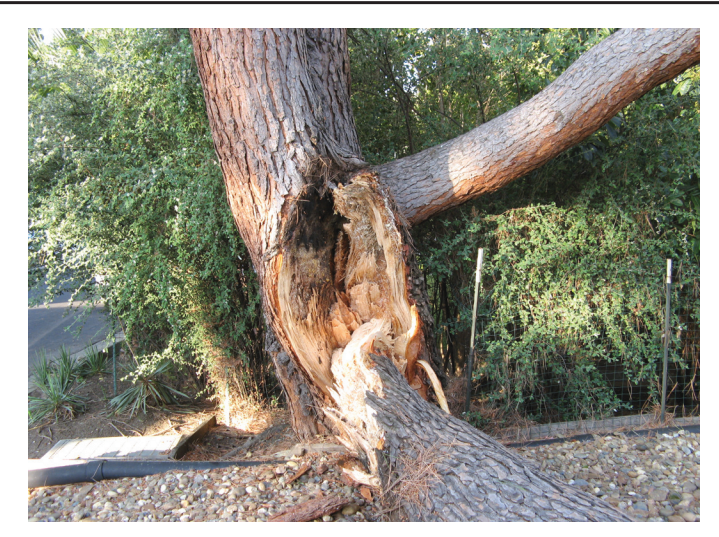
Figure 3. (Above) Codominant stems and multiple trunks were the most commonly reported defect causing trunk failure in Italian stone pine. Here, a large comdominant stem failed at the point of attachment. Embedded bark is not commonly found in such failures in P. pinea .